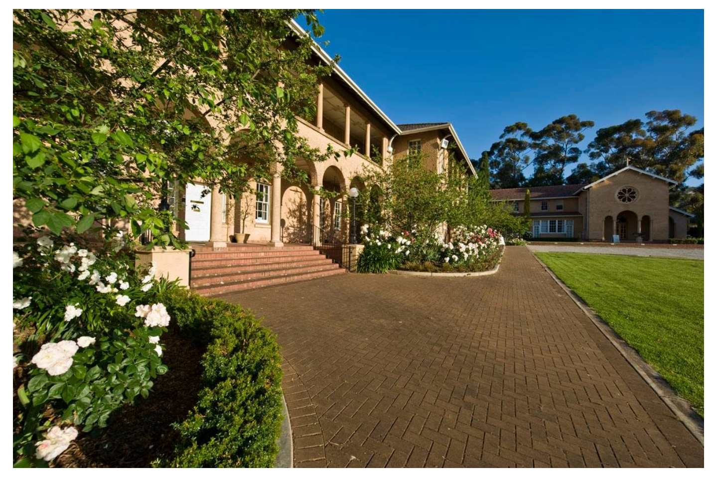
Please read the latest Parish Bulletin here.