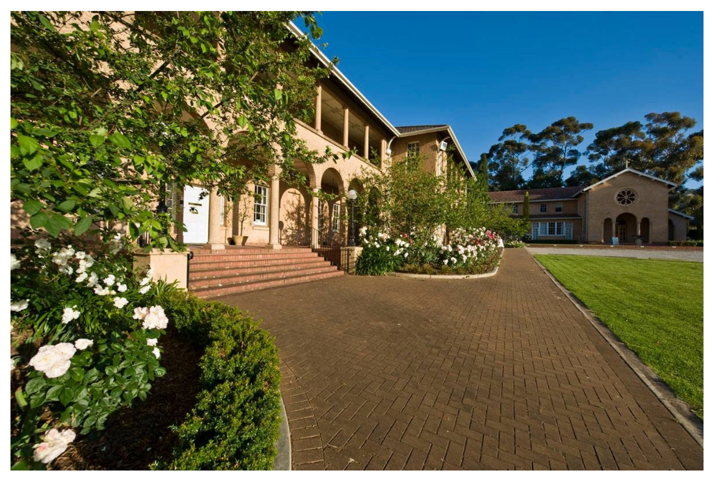
Please enjoy reading the Parish Bulletin which is available here.