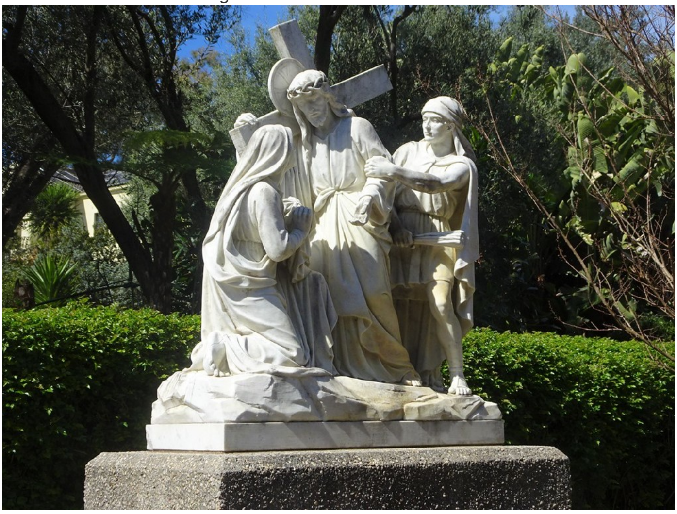
The latest Parish Bulletin is available here. The Easter Program for 2021 can be viewed here.