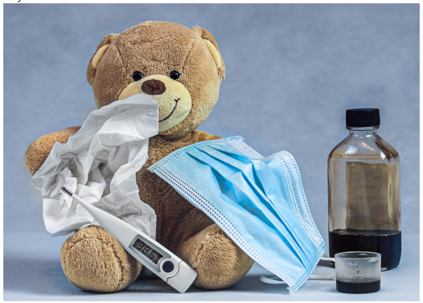
It is important that students who are unwell stay at home to stop the spread of illness within the school community. Thank you.