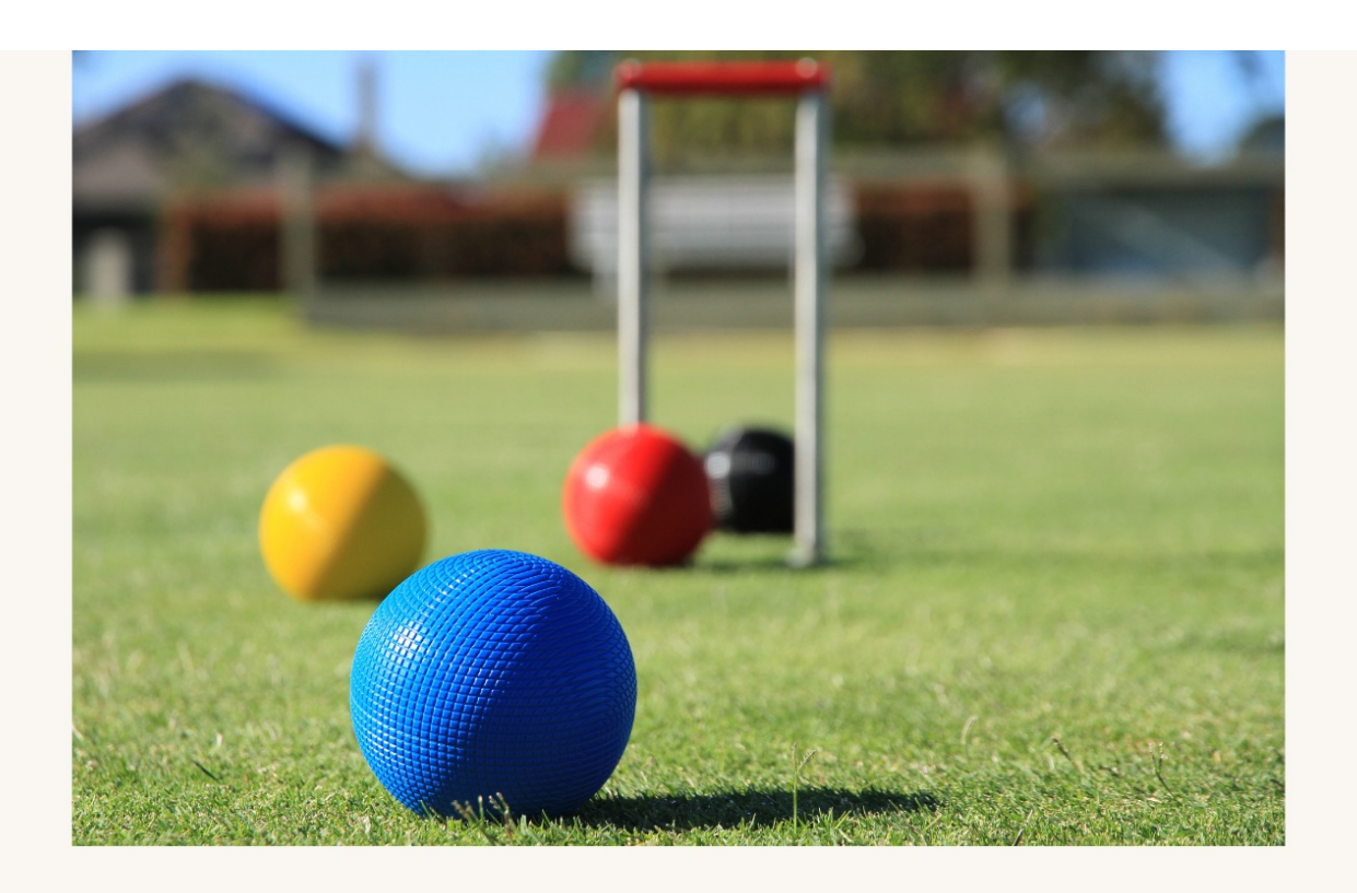
Hyde Park Croquet Club